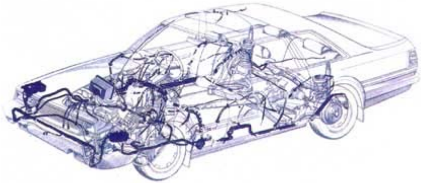
Dimensions of COT TUBE

COT TUBE for wiring harnesses. Used in automobiles. By JIS (Japanese Industrial Standard) cot tube make from high quality PP (Poly Propylene) nonflamable.